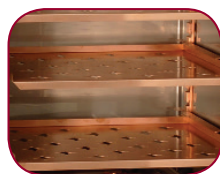
copper shelving option