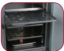
unique design keeps shelf from tipping